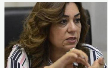
Manal Awad Mikhael , first female Coptic Christian governor and second female governor in Egypt