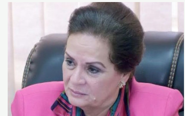
Nadia Ahmed Abdou Saleh , first female governor in Egypt