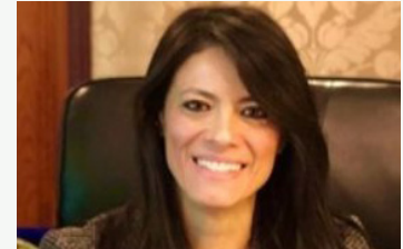
Rania Al Mashat , Minister of International Cooperation